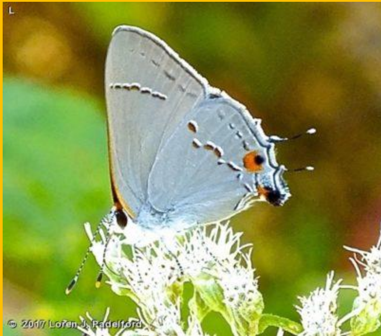
Butterflies on Turkey Creek Nature Preserve 2019